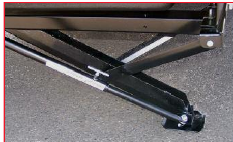
JT's Strong Arm Jack Stabilizers installed on telescoping Jacks