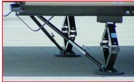
Typical rear installation of JT's Strong Arm Jack Stabilizers installed on Scissor jacks requires that the stabilizer tubes angle toward the center of the rig as much as possible to stop side-to-side movement.

Using a unique system of custom designed and engineered clevises, swing-bolts and mounting hardware enable JT's Strong Arm Jack Stabilizers to attach to and stabilize any of the three main types of jacks found on RVs: Scissor, Electric and Telescoping.