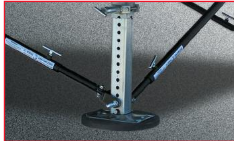
JT's Strong Arm Jack Stabilizers installed on electric Jacks