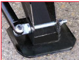
JT's Strong Arm Jack Stabilizers connected to a telescoping jack