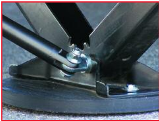
JT's Strong Arm Jack Stabilizers connected to a scissor jack